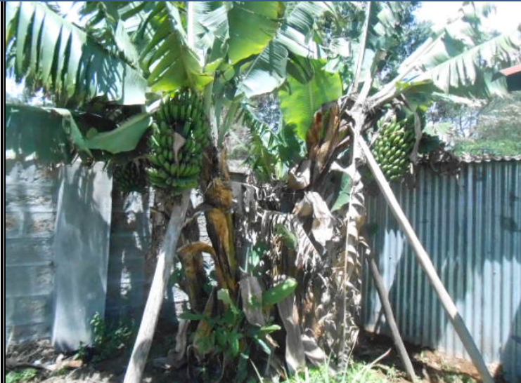
Banana tree at ASN Upendo village and its produce. It's one of the Income generating Activities under the department