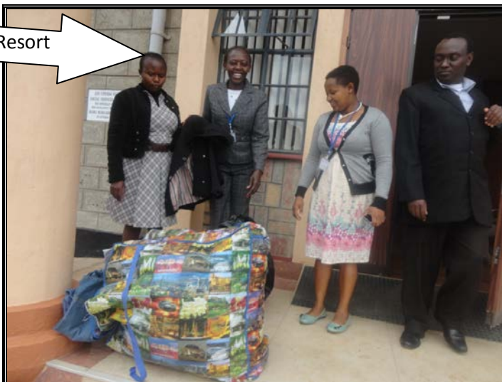
Staff from Enashipai Resort donating clothes to Upendo Village as some of staff members watch