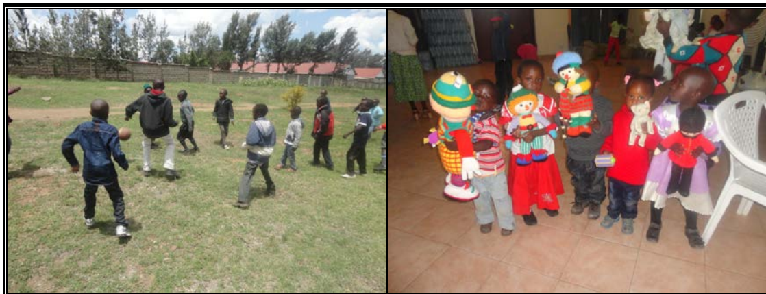
Left: A team of young boys playing football. Right: Young children with dolls and toys.