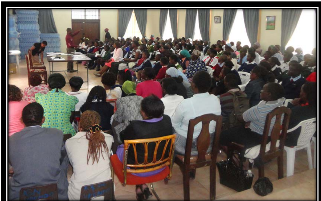
A staff member giving a talk to students, parents and their guardian during academic day

The first academic day took place in April 21 st and was attended by all sponsored kids from Kindergarten to class 7 accompanied by their parents/ guardians. This academic day was attended by a total of 80 pupils. During academic day 1, the pupils benefited from motivational talks by various speakers from among the Upendo Village staff. Those pupils who had performed exemplary in different levels were awarded for their hard work.